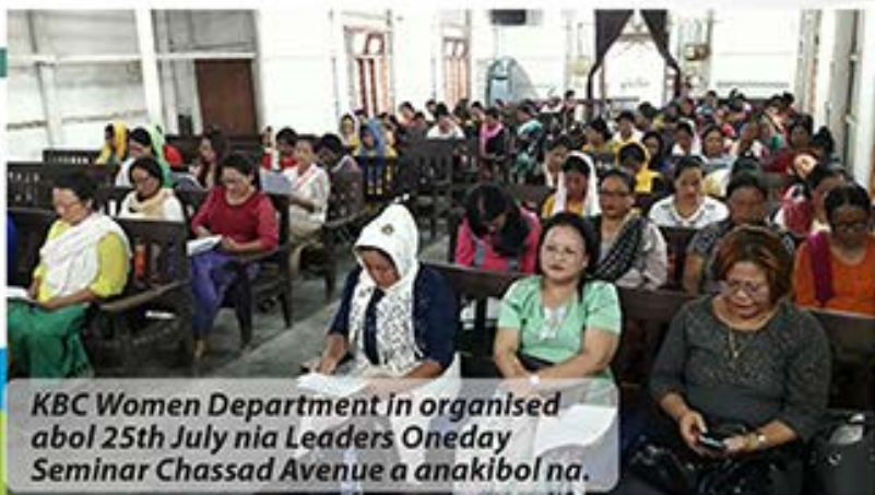
KBC Women Department in organised abol 25th July nia Leaders Oneday Seminar Chassad Avenue a anakibol na.