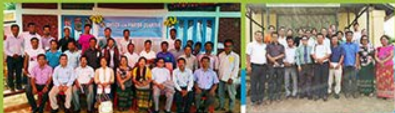
KBC Secretaryho Tour achenau Gambih No 7, 8 leh 9.