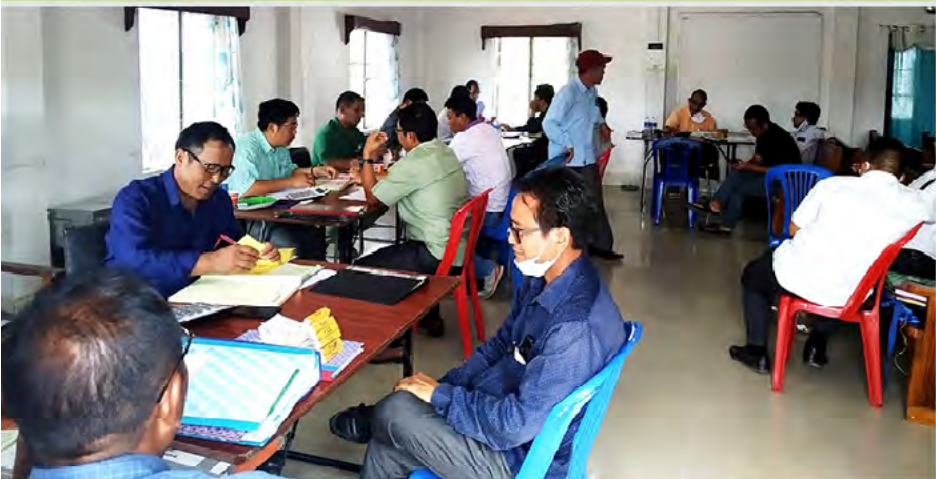
KBC Events "KUMKIM AUDIT" Office Chapel hall mun a boina umlouvin ana chelha tai.