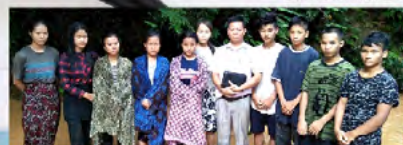
Gambih No. 15