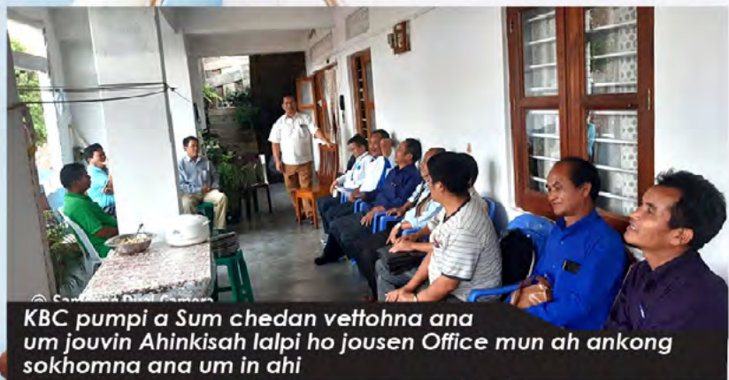
KBC pumpi a Sum chedan vettohna ana um jouvin Ahinkisah lalpi ho jousen Office mun ah ankong sokhomna ana um in ahi