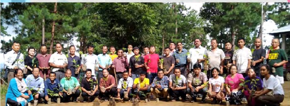
KBC Missionary/Evangelist hon Elizah Prayer Mount a thingkeh tuna aneinau

If undelivered, please return to The Editor. KBC Thuso KUKI BAPTIST CONVENTION Opp. DM College, Imphal - 795 001 Contact: 9862633173