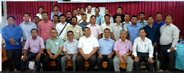
Men Department Council KBC Office mun a ana um