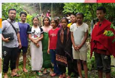
Gambih No. 15