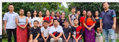
Gambih No. 21