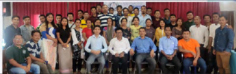
Youth Department Council toukhomna KBC Office mun a ana um