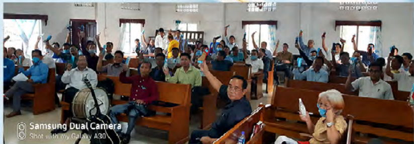
KBC Development Section makaina noi Lockdown toh kilhon in Senitizer leh mask hopdohna ana um in ahi.