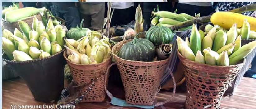
Boina tampi umjongleh Pathen heng ah Anthah Ihun Maicham mun phabep a ana che lha in ahi