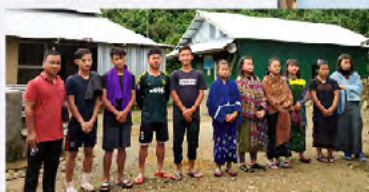
GAMBIH 7 TINGKAI