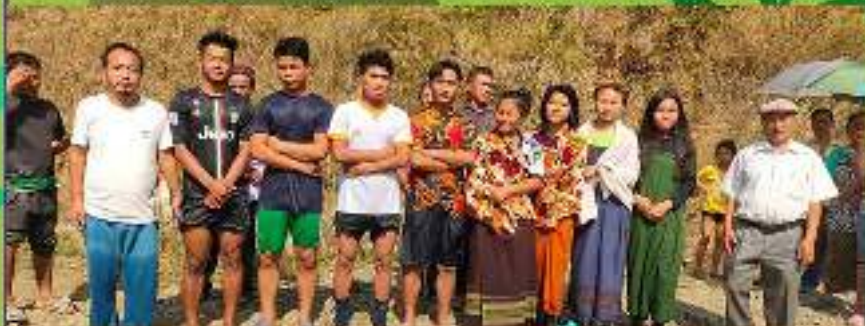
28th February 2021 nin Molnom B/church a mi 8 in Tahsan tuilut na anei tave