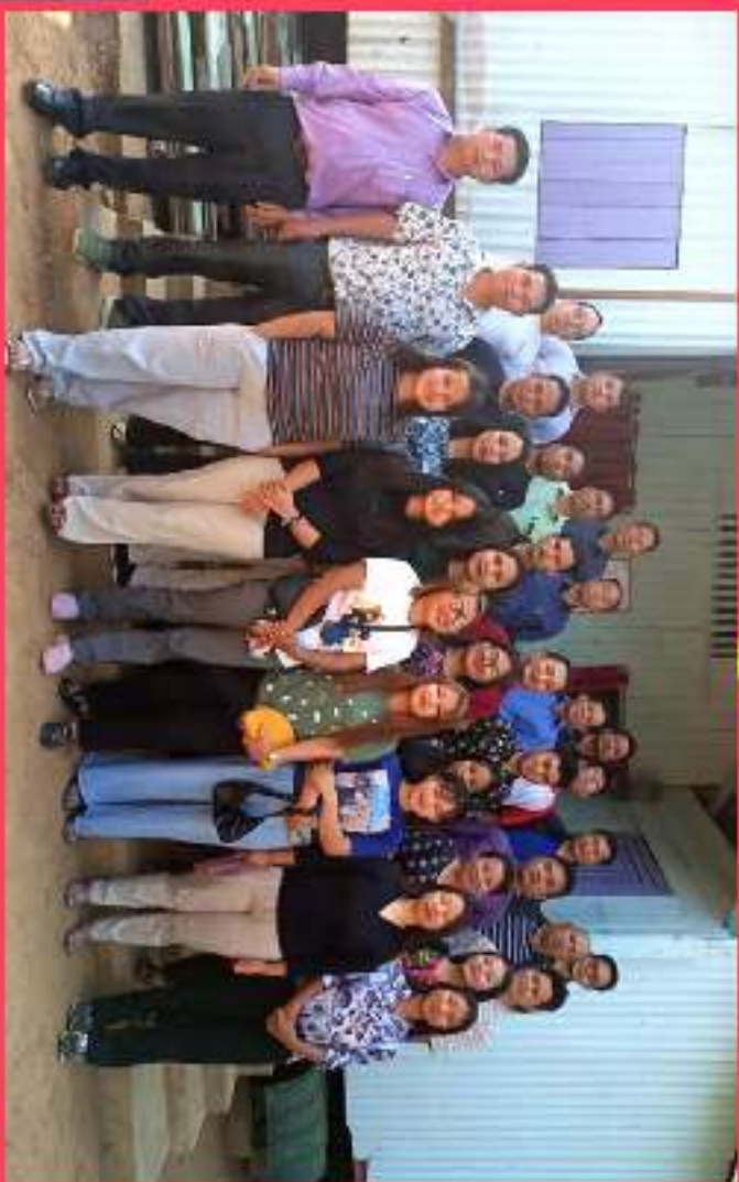
Participants of KBC School Teachers Orientation Inaugural Function, at Dr. Colvin Academy, Moreh from 15-17 February 2021 with CER, Gambih Pastor & C/C Pastor.

If undelivered, please return to The Editor, KBC Thuso KUKI BAPTIST CONVENTION Opp. DM College, Imphal - 795 001 Contact: 9862678174