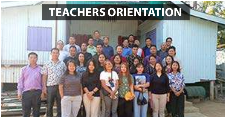
Participants of KBC School Teachers Orientation Inaugural Function held at Dr. Colvin Academy, Moreh from 15-17 February 2021 with CEB, Gambih Pastor & C/C Pastor.

Pakai chu hung kit ding ahi, ama ahung teng leh sangan chung'a hung talou ding ahi, loupe tah'a leng hina a hung ding ahi tai.