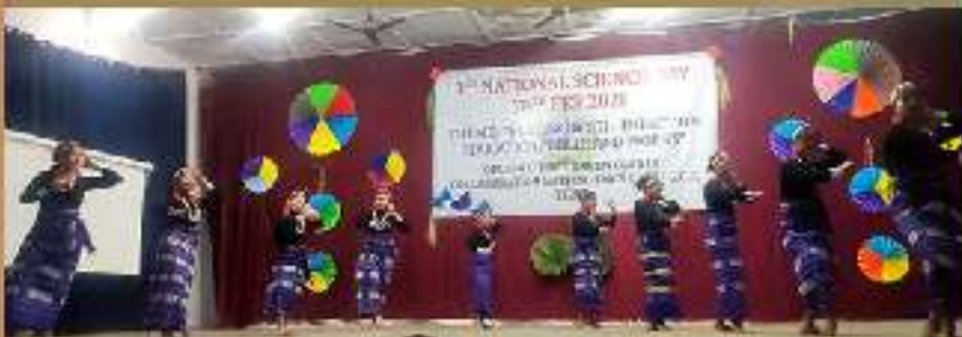
National Science Day IGG College Tezu a KBC Mission Hostel (TGH) um chapang hon Hostel minnin 28 February nikhon pan analah naove.