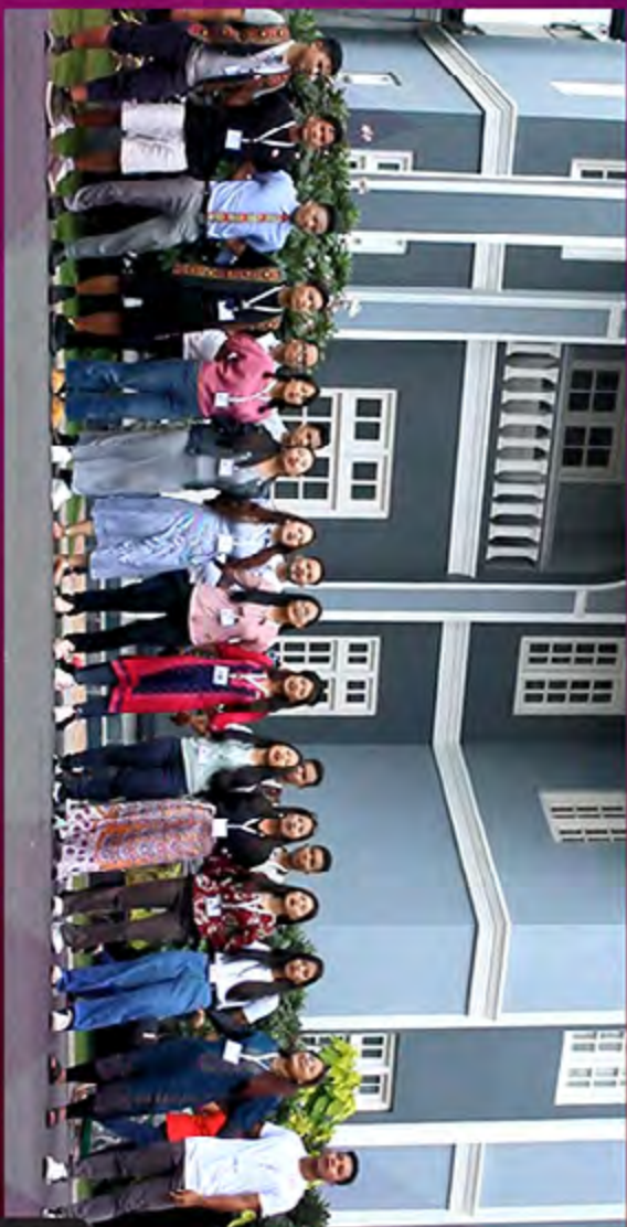
KBC Central Choir at Ramoji Film City, Hyderabad