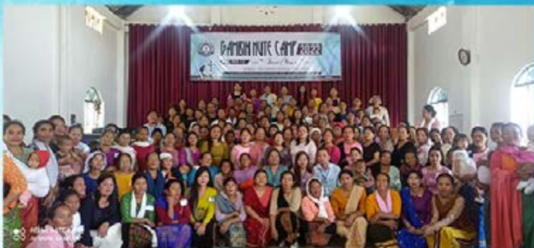
Gambin Na. 12 Nute Camp lolhing tah in ana kichaitan ahl.