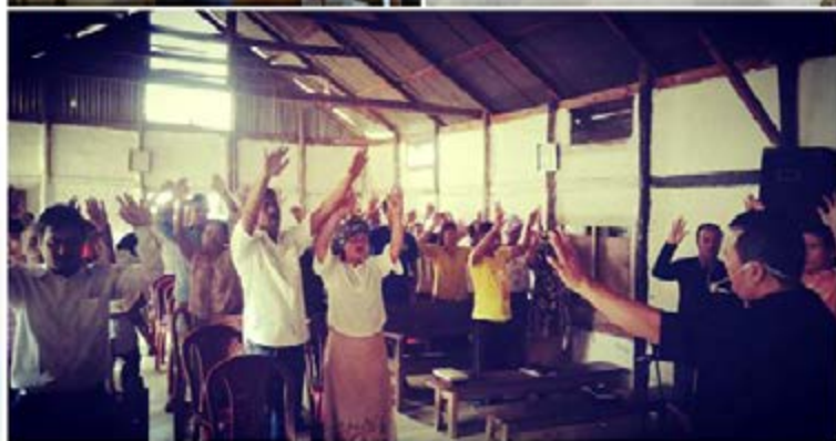
Centre Church Molkon a Nupa Camp lolhing tah in ana kichaitan ahl.