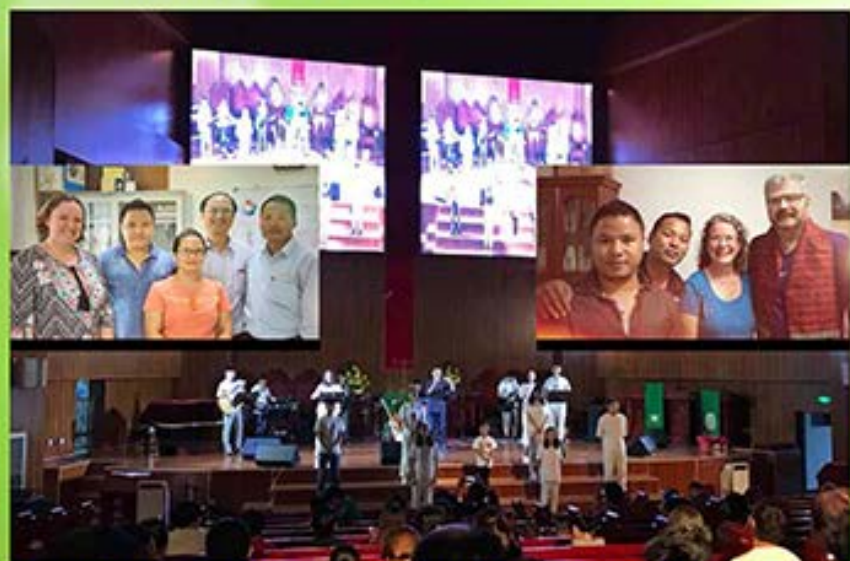
14th August akon in KBC Mission Secretary in interna tional Field Tour ana bol in 1st September nin dam in ahung lhung kit tan ahi.