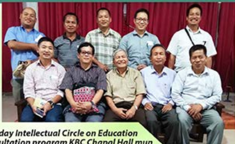
One-day Intellectual Circle on Education Consultation program KBC Chapal Hall mun ah september 6 nikhon Education Board makainan ana um in ahi.

1st September nin Gambih no. 8 Nute Anngol taona C/C.M. Thingjaboung mun a ana kimang tai.