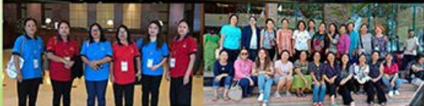
KBC Women Secretary lamkaina in Nute phabep 13th ABWU Conference. Penang, Malaysia 29 Aug.-1 Sept. 2018